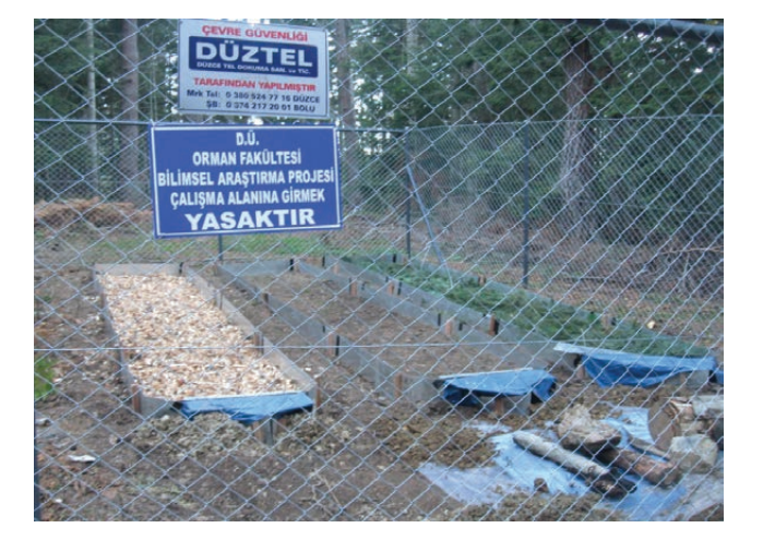
Figure 1. Establishment of runoff plots on skid trails Slika 1. Definiranje ploha otjecanja oborina na traktorskim vlakama

In determining the amount of the runoff, the amount of runoff passing into the soil after a rainfall was measured and recorded. Measurement of the runoff accumulated in the collection tank was carried out using scale cylinders. During the study, the runoff measurements were recorded repeatedly after each rain. The amount of runoff occurring after prolonged and heavy rainfall was measured on the same day or the next day. In this way the risk of exceeding the capacity of the storage tanks was prevented. When rainfall was not long term or severe, monthly measurements were taken. Nine measurements were taken from the study area throughout September 2014-March 2016. A total of 108 water samples were collected from the test sites, 36 each from the control, wood chips and slash plots. After the measurement and recording process was completed, the runoff in the storage tanks was completely drained.