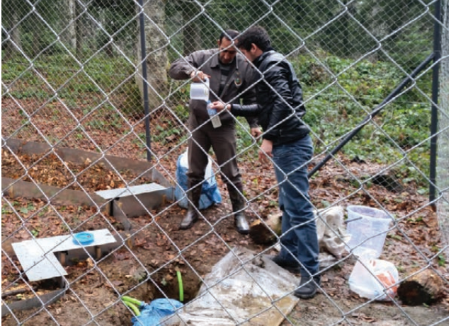
Figure 2. Water sample collection Slika 2. Prikupljanje uzoraka vode