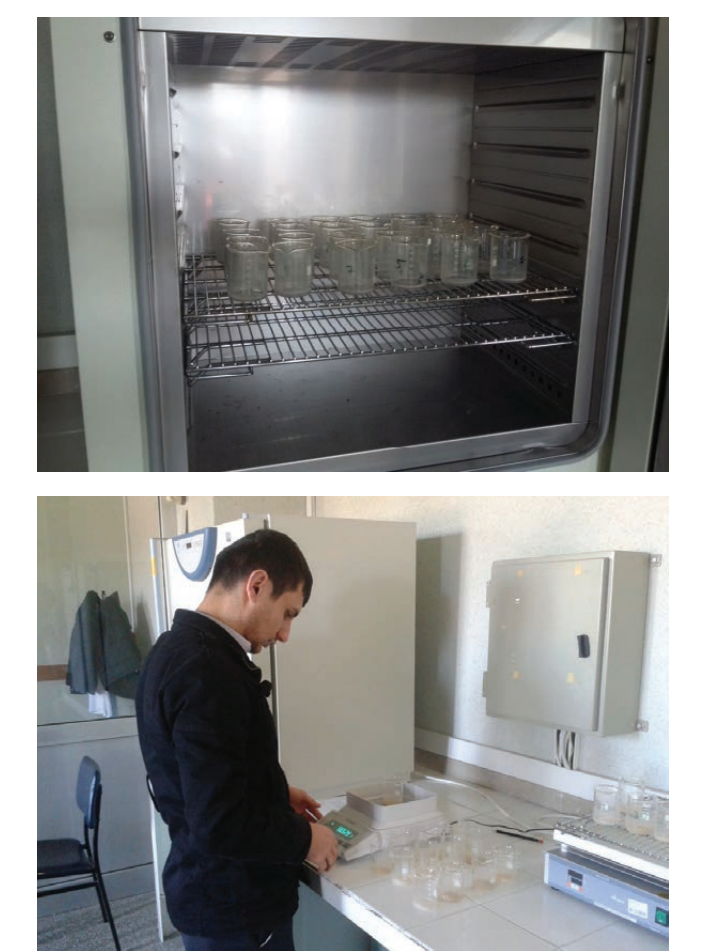
Figure 3. Water sample analysis at the Faculty of Forestry Watershed Laboratory

Slika 3. Analiza uzoraka vode u laboratoriju Watershed na Šumarskom fakultet