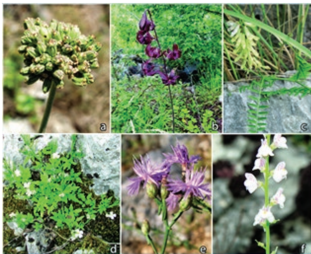
Figure 3. Some of endemic taxa of Matokit Mt: a) Seseli tomentosum Vis., b) Lilium martagon L. ssp. cattaniae (Vis.) Degen, c) Vicia ochroleuca Ten. ssp. dinara (K. Malý) Rohlena, d) Cardamine fialae Fritsch, e) Centaurea glaberrima Tausch, f) Linaria microsepala A. Kern.

Slika 3. Neke endemične svojite planine Matokit: a) Seseli tomentosum Vis., b) Lilium martagon L. ssp. cattaniae (Vis.) Degen, c) Vicia ochroleuca Ten. ssp. dinara (K. Malý) Rohlena, d) Cardamine fialae Fritsch, e) Centaurea glaberrima Tausch, f) Linaria microsepala A. Kern. (autorske fotografije)