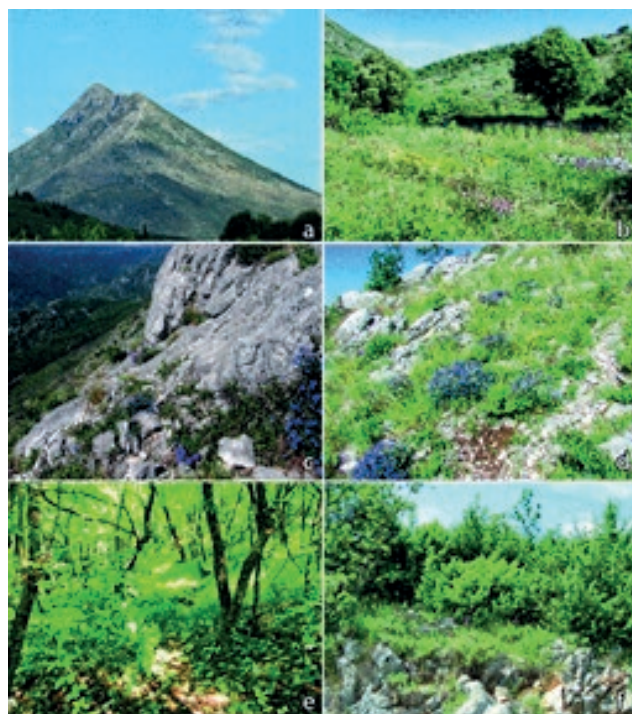
Figure 2. Matokit Mt (Biokovo Massif) and its habitats: a) peak ridge, b) submediterranean grasslands Saturejion subspicatae , c) rocky crevices with endemic Moltkia petraea (Tratt.) Griseb., and Edraianthus tenuifolius (Waldst. et Kit.) A. DC., d) rocky grasslands Saturejion subspicatae with domination of Sesleria tenuifolia Schrad. ssp. tenuifolia and Moltkia petraea (Tratt.) Griseb., e) submediterranean forest of the alliance Ostryo-Carpinion orientalis , f) rocky grasslands and shrubland with stands of Juniperus oxycedrus L.

Field research of vascular flora was carried out on Matokit Mt, as a part of Biokovo Massif, including its foothills (with nearby settlements), northern and southern slopes, the whole ridge of the mountain, covering different habitats,