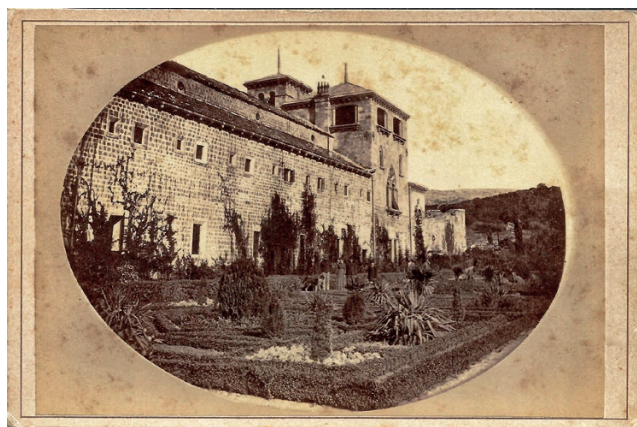
Figure 2. Photo of the ornamental gardens in front of the Maximilian's Residence, behind 1870, author Tomaso Burato (source: Dubrovnik Museums, Postcard Collection, F-3464).

On the basis of the mentioned sources and data collected in our own research, the following was analysed: number of individual taxa (species, subspecies, varieties, hybrids and cultivars), affiliation to genera, family, areal, number of autochthonous taxa, number of allochthonous taxa from different continents, and taxa introduced in Croatia for the first time. The status of invasive alien species (Inv - after the taxon name) was denoted according to Nikolić et al. (2014).